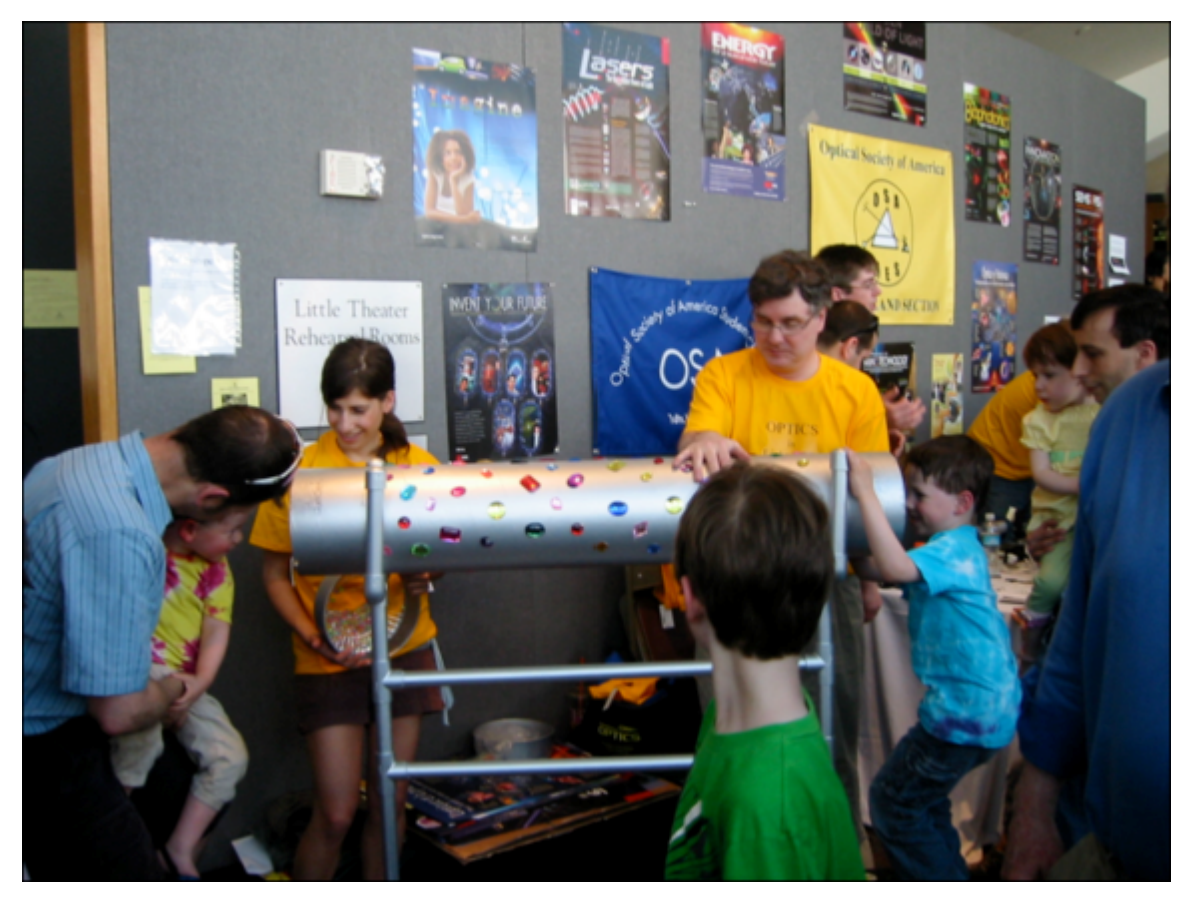
Figure 1 Kaleidoscope used at both ends.

We allow the kaleidoscope to violate the Concept/Context rule since it is just plain fun for parents and kids. We also will remove the eyepiece and target (Figure 1) to allow folks to look at each other from both ends. Removing the target and replacing it with a parent's face frequently results in gasps and is entertaining to both ends. We also encourage parents to take photos of their multi-faced (Figure 2) children so the participants have something to remember the experience.