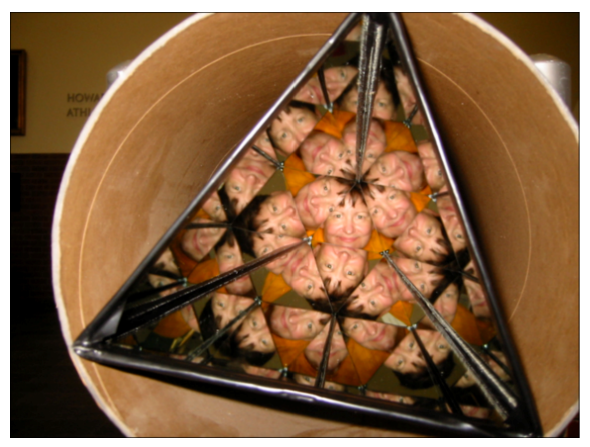
Figure 2 Kadeiscope image of one of the co-authors