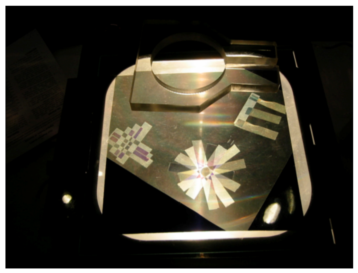
Figure 5 Birefringence of tape shown between two crossed polarizers on a light table

Optical power is based on a refractive index difference, higher power with a larger difference. The water tank readily shows this concept by measuring the focal length of the beams as they converge from the positive lens in water and then in air. The four times index difference increase causes a similar four times increase in optical power when the focal point goes from 12 inches to 3. This can lead to discussions on underwater goggles and thickness of one's eyeglasses.