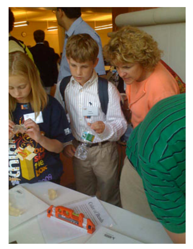
Figure 6 Student explaining refraction to parent