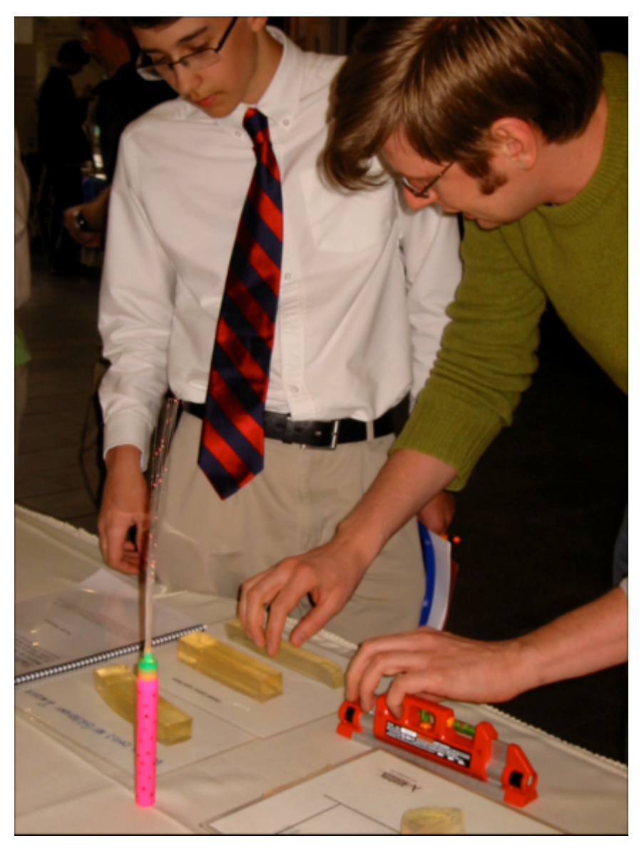
Figure 4 Co-author demonstrating Total Internal Reflection in Gelatin Lightpipe

As mentioned before, we now place gelatin between the polarizers. Placing a rubber band around a block of gelatin provides the stress needed to show the birefringence. The gelatin and also be pushed and squeezed showing the birefringence affects.