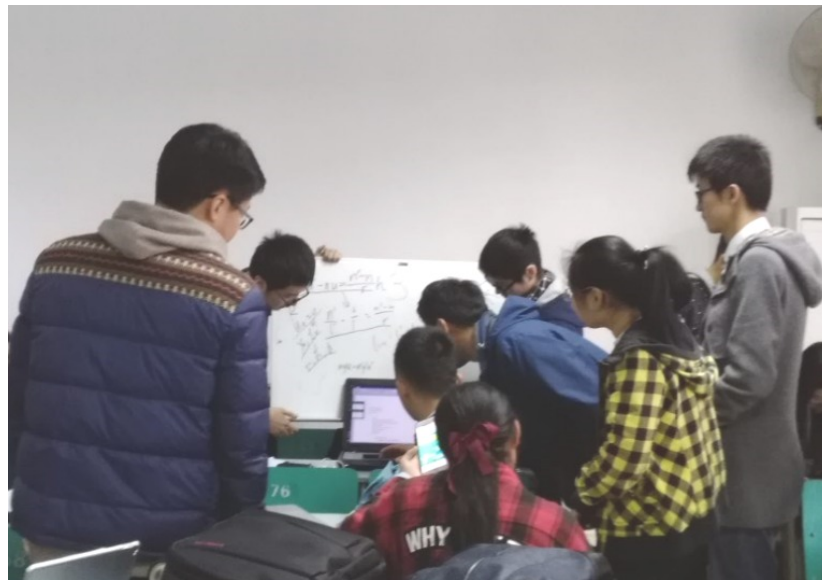
Figure 2. A study group is in discussion

When learning microscope and its illuminator as shown in figure 1, the conversion between aperture and field stop in an imaging system and its illuminator is also an important topic for discussion. This is already presented as a hint when studying the concepts of aperture, pupil and field stop: considering a system composed of two sub-systems, if each sub-system has its pupil and field stop respectively, will the entrance rays be stopped in the combined system? Why? If some entrance rays are stopped, how to let them not to be stopped? What conditions should be satisfied if the imaging rays can transmit through sub-system 2 as well as they can transmit through sub-system 1? The discussion of this issue continues from spring semester to summer and attracts every study group.