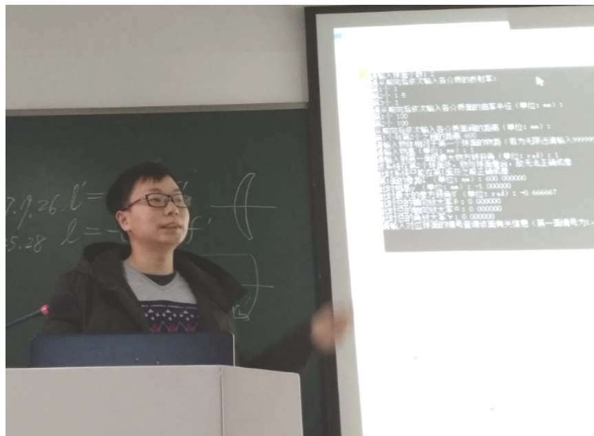
Figure 3. A group representative is giving a report about their programming

Another small group work is to measure the focal length of a mobile camera. The work includes analysis of the errors. This is also completed by a small group of 2 students. The group works promote successfully the team spirit of our students.