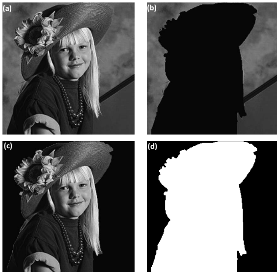
Fig. 2 (a) The original image used to generate constraint. (b) and (c) are amplitude constraints on planes P_1 and P_2 , respectively. (d) The constraint area on plane P_2 .

the modified amplitude distribution, and is then propagated to the next plane.