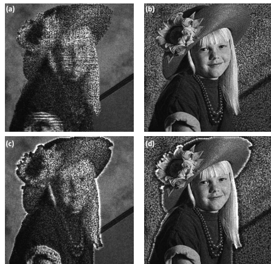
Fig. 3 The simulated amplitude distributions on planes P_1 and P_2 , respectively. (a) and (b) are the results by our method. (c) and (d) are the results by the complex distribution addition method.

Figures 2(b) and 2(c) show the amplitude constraints that are used in the simulation on two output planes, i.e., planes P_1 and P_2 , respectively. They are generated by segmenting the original image in Fig. 2(a). The resolution of these three images is 256 \times 256 , and is padded to 512 \times 512 by zeros during the calculations to avoid circular convolution. Figure 2(d) shows the constraint area on plane P_2 . When light propagates to this plane, the amplitude distribution inside the constraint area (the white area) is substituted by the image content, and the amplitude distribution in the dark area is intact during propagation. The