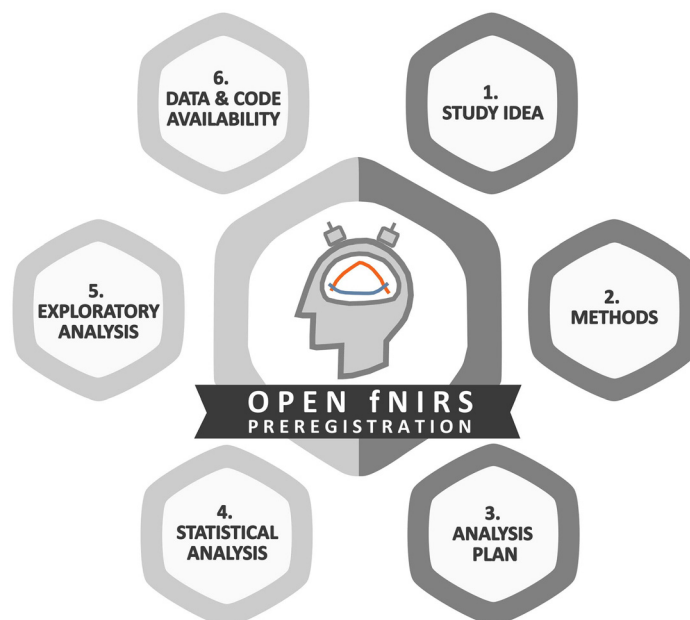
Fig. 3 Overview of the fNIRS study design guide structure.