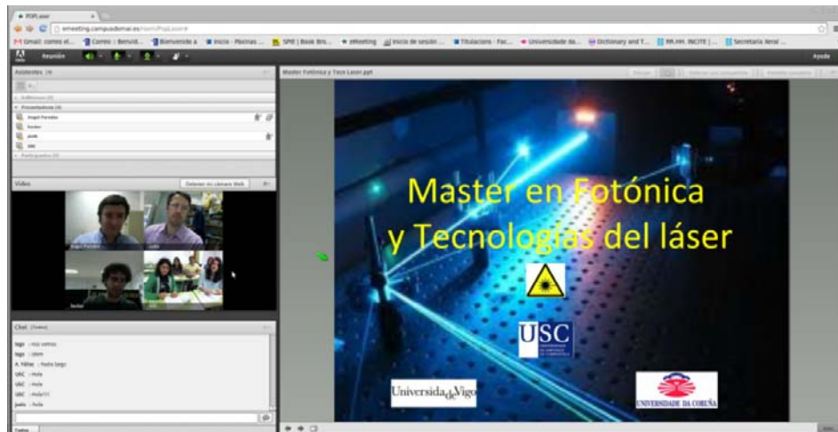
Fig. 1: Screen shot of the Adobe Connect ® online classroom used in the master of "Photonics and Laser Technologies".

The online conference, meeting and e-learning software Adobe Connect allows for the simultaneous transmission of voice and video. The software permits the connection of all the users with their own computers, including their webcams and microphones for correct interaction with the teacher. The access to the online platform is through a web browser. The web page is divided into sections that can be organized depending on the demands of the course. Typically, the page is organized with an area for the video cameras, other area for chatting and other for the presentation of the documents used by the teacher. It is important to point out that the visualization of the documents is as good as in the computer of the teacher. There are additional options as for example blackboard for drawing. Normally the area where the documents are presented is bigger to facilitate its observation, although every area can be maximized to improve visualization. For example for experimental demonstration the maximization of the area of the video camera would help. Figure 1 shows the aspect of a typical virtual classroom. At the top there are the controls of the sound and webcam. In the left hand side there is the list of participants, the webcams and the chat. The big area is for the presentation of the documents. Exemplary we show in this figure four webcams (one of them showing one of our classrooms).