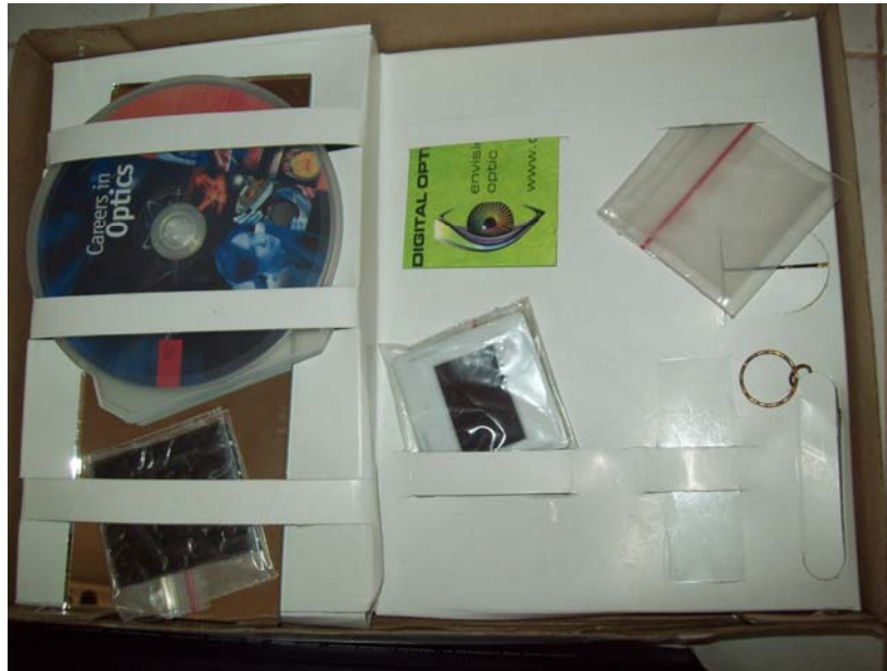
Figure 4: Inside view of Optics kit