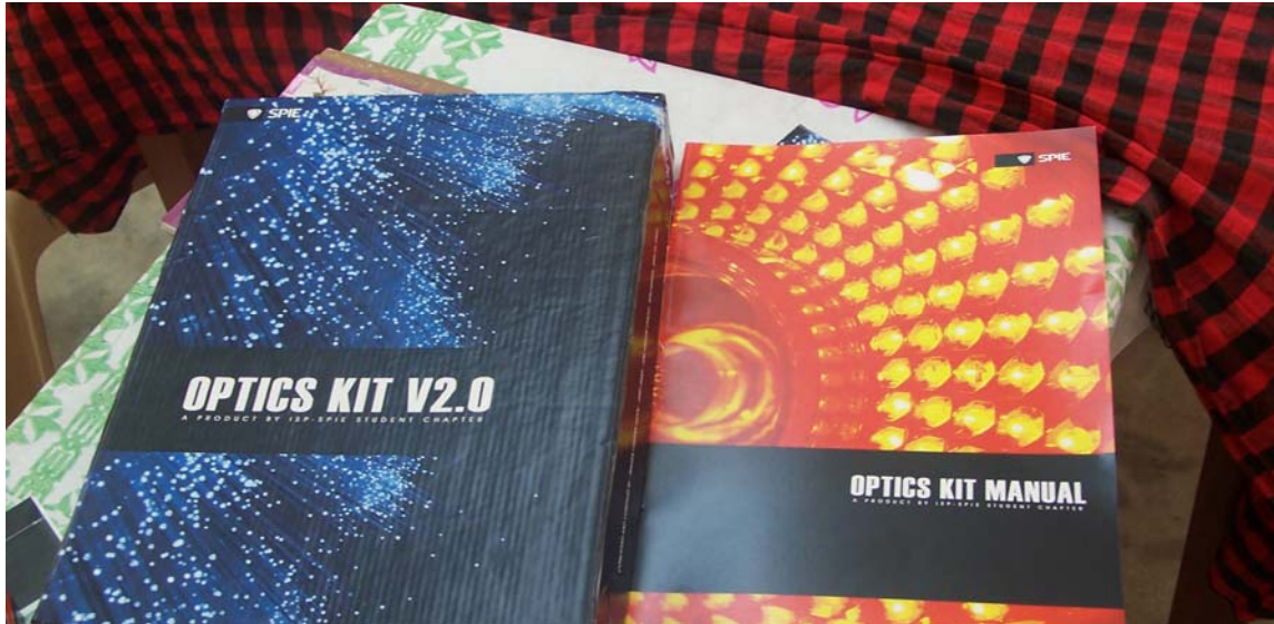
Figure 3: (on left) Packaging of beta version 2.0 of the optics kit (on right) Optics Manual

The content of the manual was compiled by a group of students in the chapter with the guidance of faculty advisor. The content was carefully designed to make it interesting for students who are using the kit. The introductory part of the manual has three sections. Manual starts with an introduction about Optics and Photonics, followed by a brief timeline about the development of the field of Optics. This section is followed by a brief note about how one can create interest in a field through anecdotes. This introductory part can create an interest for the user to go forward and try out the experiments involved in the kit.