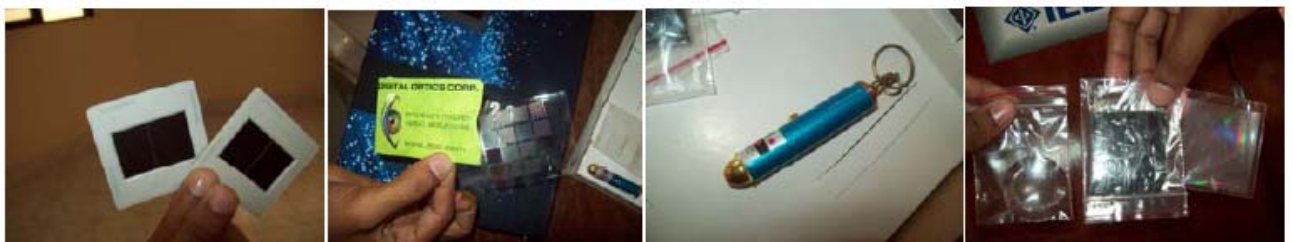
Figure 5: Various components in Optics kit

The transverse nature of light can be shown using experiments related to Polarization. There is a pair of slits and rope to demonstrate the mechanical analogy of polarization. This concept can be extended and demonstrated using the Polaroid sheets provided with the kit. By keeping the microscopic slide, stuck with cello tape between the Polaroid sheets, demonstration of photo-elasticity can be performed to give more opportunity for fun for students.