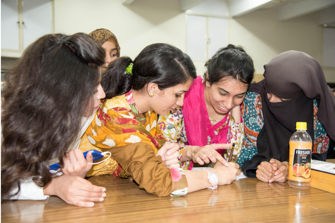
Figure 5. Part of the active learning environment is the free discussion that precedes and follows observations among members of individual groups. In this case, the discussion is among undergraduate students at Quaid-i-Azam university in Islamabad, participating in a special one-day active learning workshop.