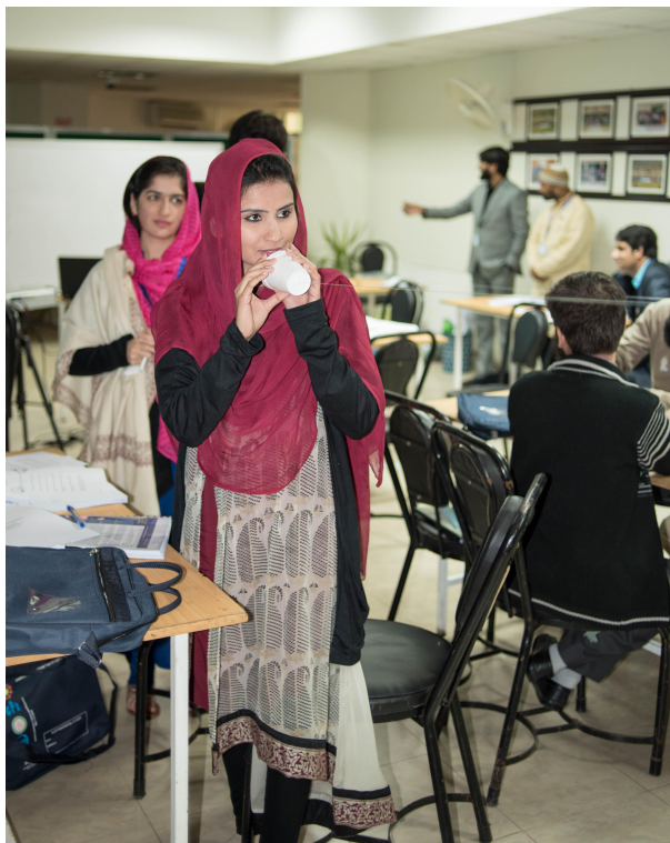
Figure 2. Participants in an ALOP at the National Center for Physics in Islamabad exploring wave transmission basics with a string phone.

principles and the price difference between "good" lenses and "good enough" ones can be significant, especially if your department doesn't have that much money to begin with.