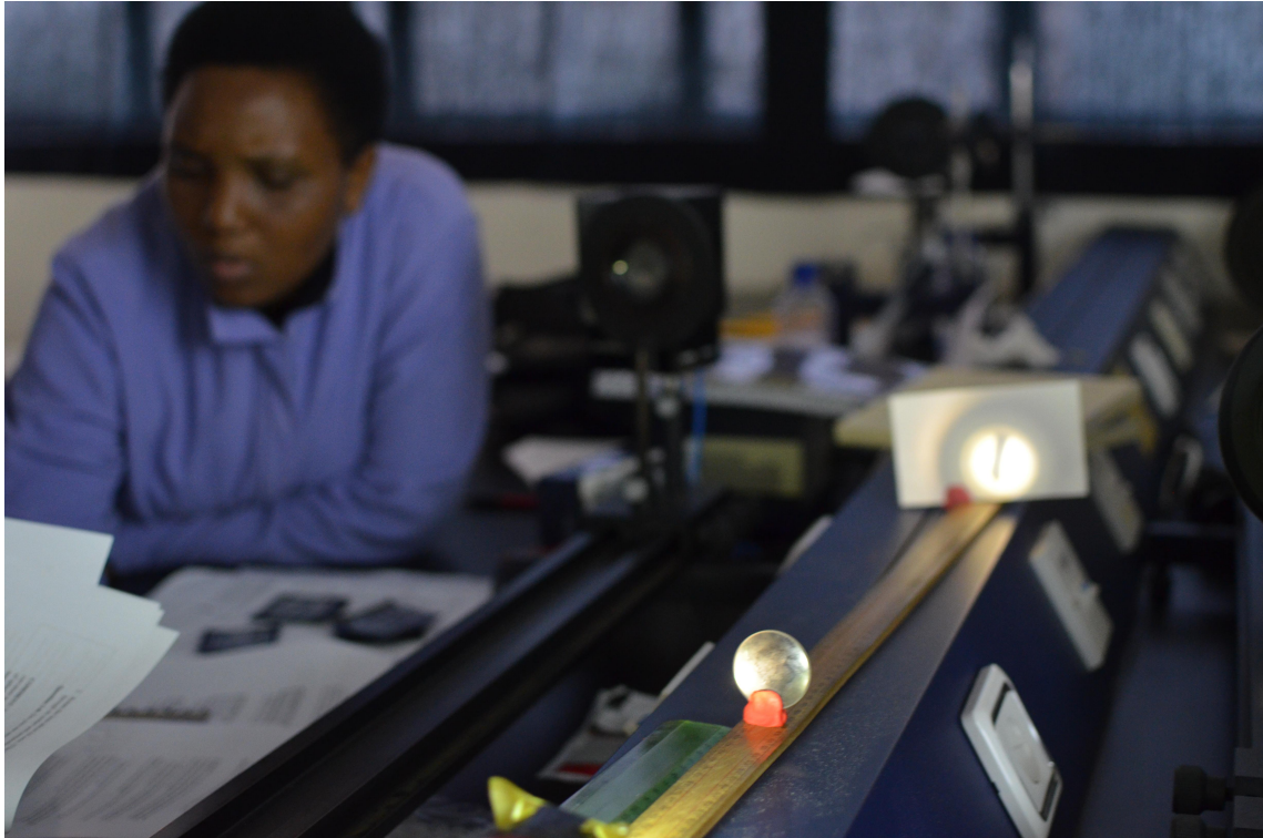
Figure 3. Unlike in physics departments in North America or Europe it is not always possible to locate 10 optical rails in developing countries for placing lenses at prescribed distances from a light source and screen. We have found that meter sticks and putty work fine for the modules and seem to be universally available.

backdrop have emerged people with exemplary courage, such as the young student Malala Yousafzai who refused to accept the notion that girls should not also participate in the educational process. Malala did not have the stature of Mohammad Jinnah, the statesman who summoned up enormous courage in the founding of her country Pakistan— she just wanted to go to school. Indeed, John F. Kennedy remarked 5 "To be courageous...requires no exceptional qualification...It is an opportunity that sooner or later is presented to us all."