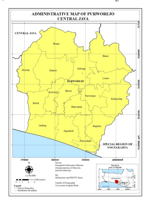
Figure 1. Research Area Map

The study area is Purworejo as shown at figure 1 below. Purworejo as Regency in the part of Central Java Province was due to the fact that in the last five years from 2014 to April 2019 have some 65 landslide with the most enormous years of the event is 2019 or have 15 landslide occurrence (Indonesian Disaster Information Data, 2019)<sup>[2]</sup>. Administratively the Purworejo district consists of 16 sub-districts, which are divided into 494 villages. Geographically, Purworejo Regency is located in the south-central part of Java Island, more precisely located at 8° 30 '- 7° 20' South Latitude, and 109° 47' 28"- 111°8' 20" East Longitude