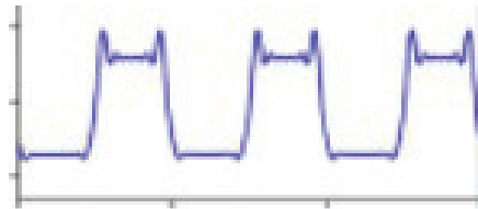
Figure 3: 2D trace of the batwing effect when measuring a periodic grating.